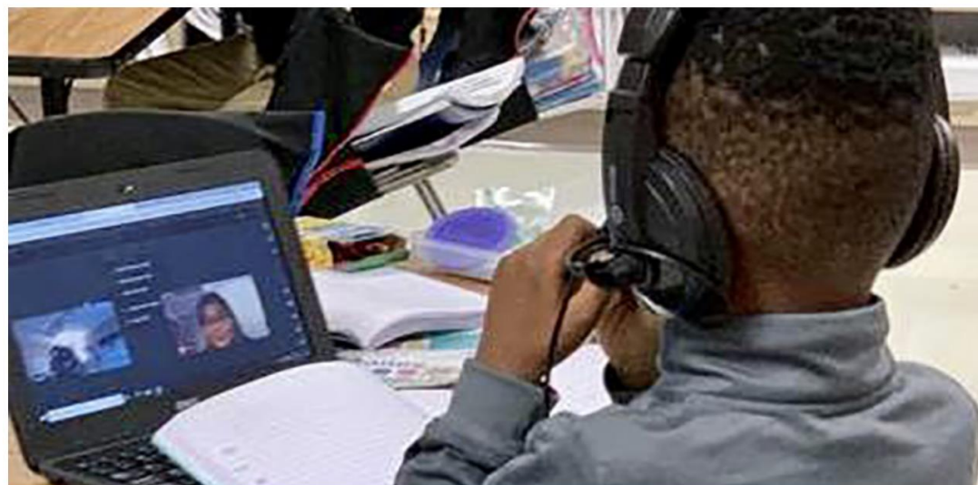
An elementary school student in Metro Nashville Public Schools receives virtual tutoring as part of the district's Accelerating Scholars program.