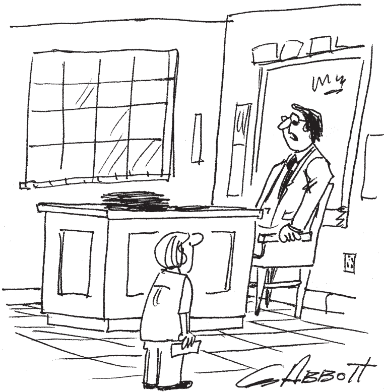
"I'm sorry, Roger, but the fact that you receive many presents at Christmas does not qualify you as a gifted student."

New to Principal . This new department is designed to give you a chance to reflect on this issue's articles and to tickle your funny bone at the same time.