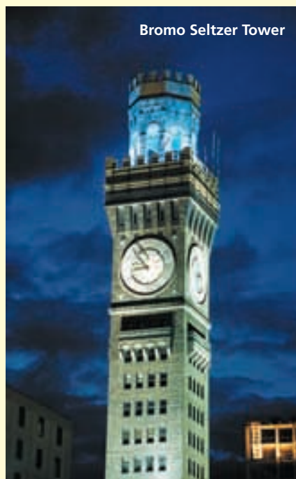
Bromo Seltzer Tower

like no other city, one that's not for the faint of heart. At the Insect Zoo, take a tour with an entomologist and see exhibits filled with cockroaches, spiders, flies, and a variety of other insects. You'll hear why insects benefit the world around us and even have an opportunity to feed a tarantula.